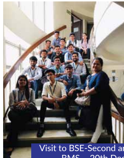
Visit to BSE-Second and Third year BMS - 20th December 2020