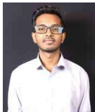
VARTIK PASI CAPEGEMINI TECHNOLOGIES INDIA LIMITED